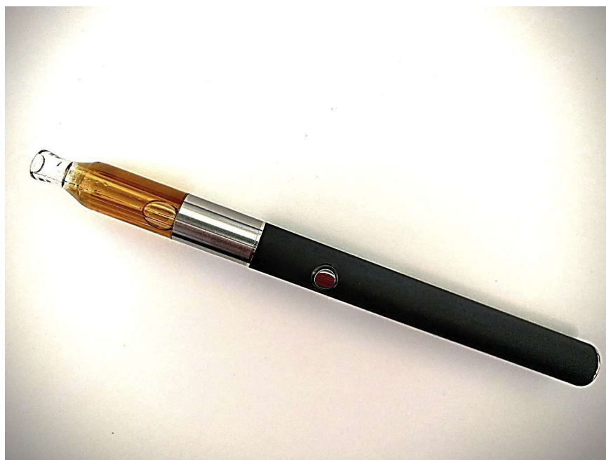
Figure 3. E-cigarette used in the Evaluating the Efficacy of E-Cigarette (E3) use for Smoking Cessation trial. Device and e-liquid characteristics can be found here: https://www.drugabuse.gov/research/research-data-measures-resources/nida-drug-supply-program/supplemental-information-nida-e-cig .

be ethical. Finally, a comparison of a combination of e-cigarettes (with or without nicotine) with individual counselling vs another combination therapy would not have been feasible for a publicly funded trial, as it would have required a substantially larger sample size. Ultimately, the choice of individual counselling as the comparator balanced the scientific, ethical, and practical needs of the trial.